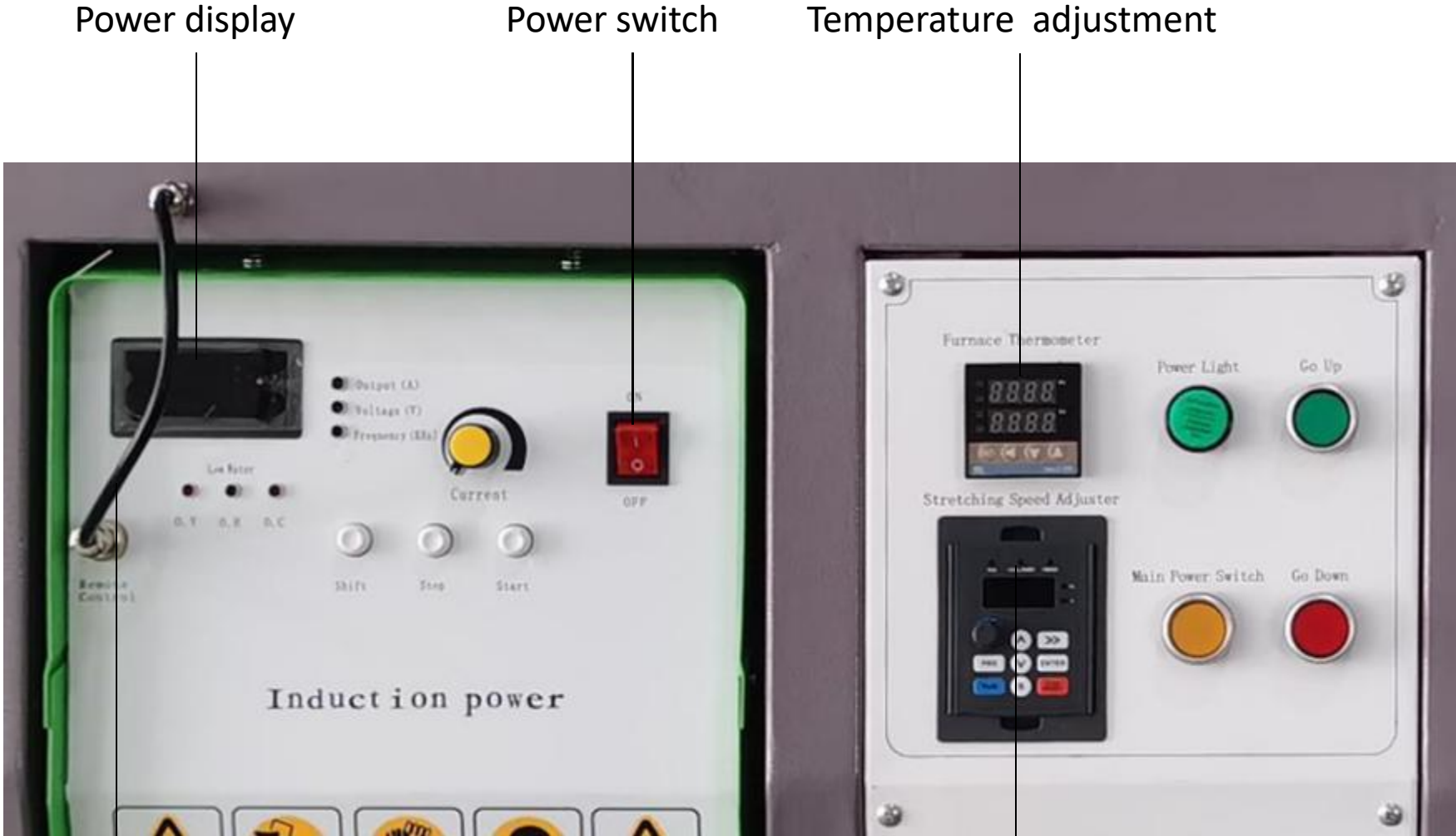
Temperature controlled wire