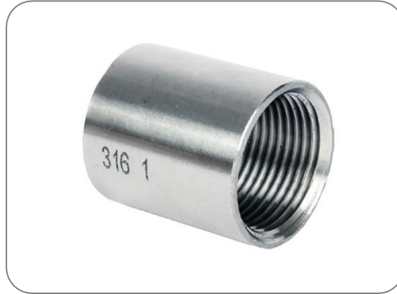
Stainless Steel Nut