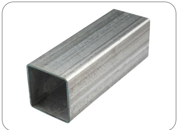
Iron Square Tube