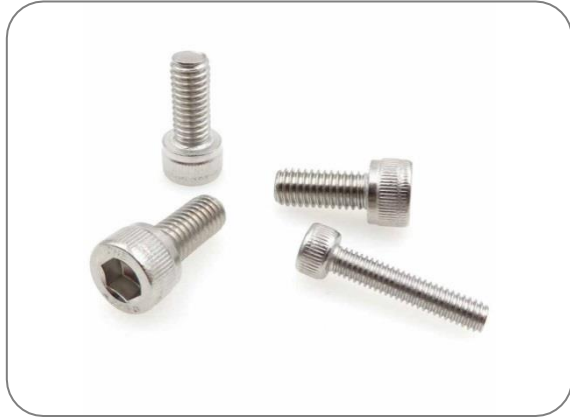
Stainless Steel Screw