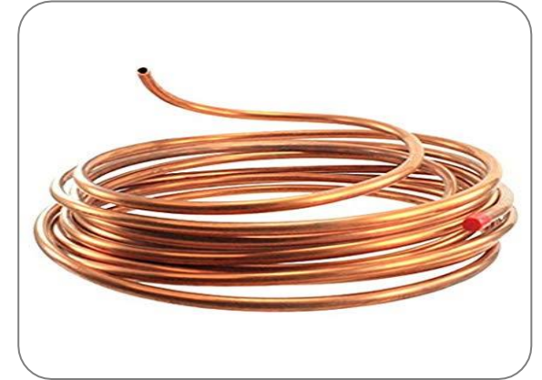
Copper Tube & Copper Rod