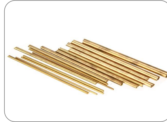
Hexagon Copper Bar